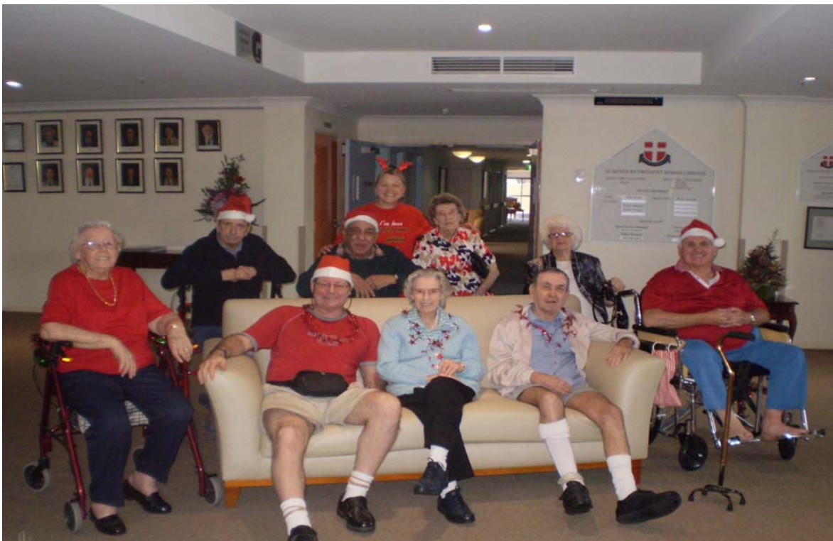
Eloura's Bowling Beauties group