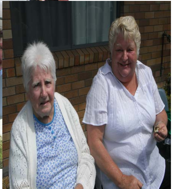
Enjoying the Sausage Sizzle